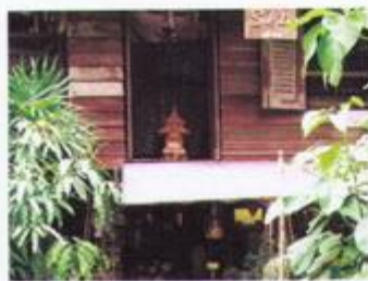
suk 11 & spa