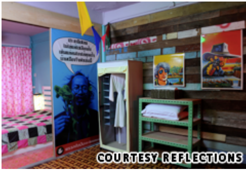
Reflections room #408, designed by Kosit Pattaranukulknorn, is called "Copy Past."

The most famous of Bangkok's trend-setting hotels is Reflections , where each room was a canvas for the ideas of a local designer. That means 34 rooms with 34 different designs.