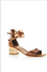
Best Buys of the Week... 20...