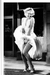
Subway dress sells for $4.6m