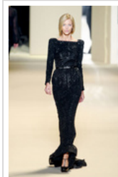
Elie Saab - Autumn/Winter 2011