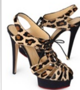
Summer Sales Round-Up