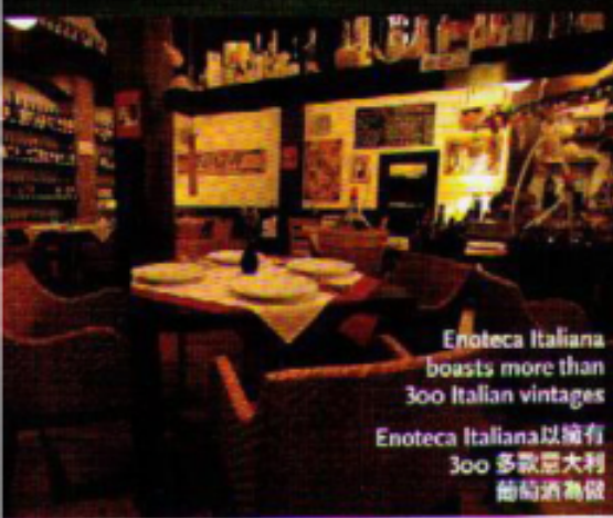
Enoteca Italiana boasts more than 300 Italian vintages Enoteca Italiana以擁有 300多款意大利 葡萄酒為傲