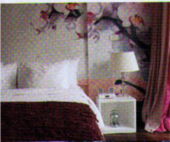
Relax at Bangkok Oasis Spa Bangkok Oasis Spa 讓你身心放鬆