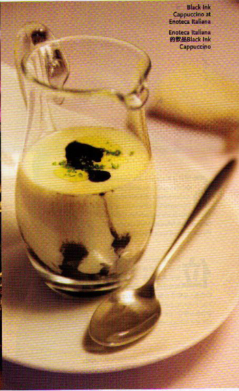
Black Ink Cappuccino at Enoteca Italiana Enoteca Italiana 的飲品Black Ink Cappuccino